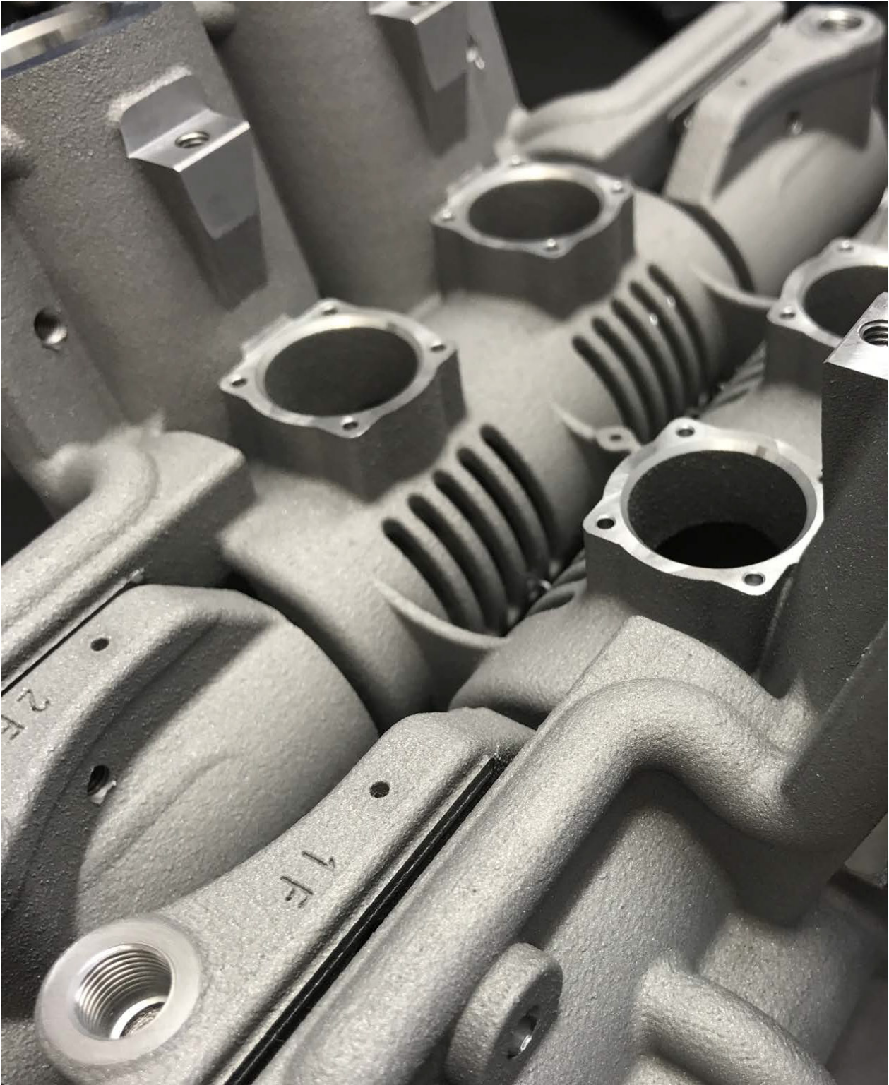
The compact galvanometer assembly inside the RenAM 500 series has been designed and additively manufactured in-house, using aluminium for high thermal conductivity, and includes conformal cooling fluid channels that ensure excellent thermal stability of the optical system.